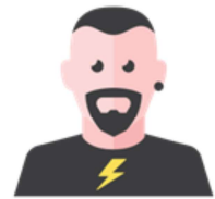
TONY - EVP